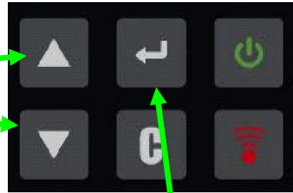
4 - Confirm