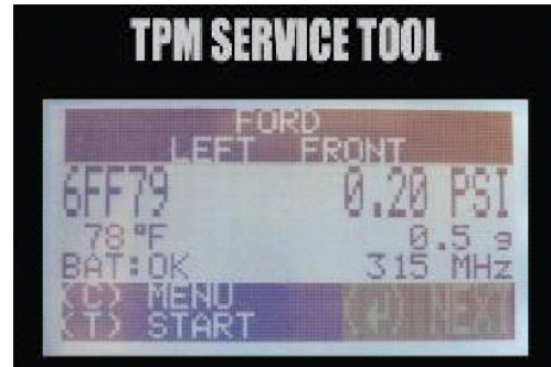
8 - Read the result