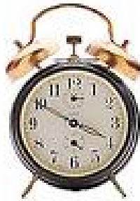
7 - Wait for the result