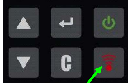
6 - Start the cycle