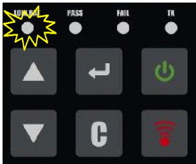
9 - Replace the battery when low bat light is flashing