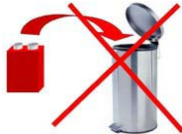
10- Please recycle the battery